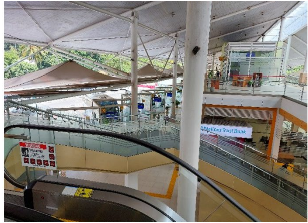
At the Kottawa Multi-modal hub

The third stop was made at the Maradana Railway Station, visiting the railway control centre. This control centre is located in the historical building of the train stations. After visiting the control centre, the station building and the platforms were also visited. The train stations serve mainly local travelling within the greater Colombo area.