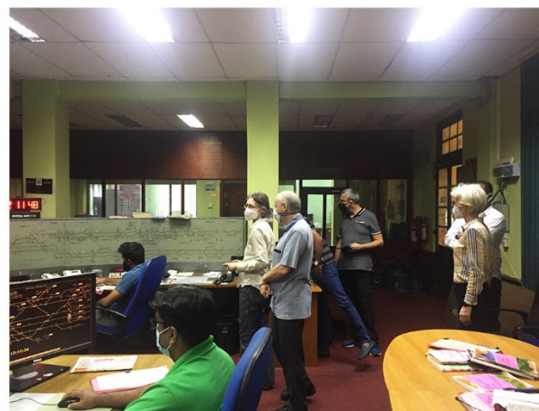
Visiting the Maradana railway station

This day visit gave a good insight about local travel conditions for starting the training course on the next day.