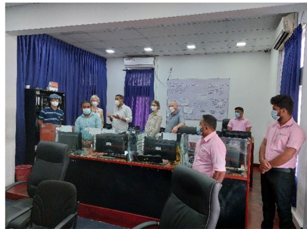
Site visit at the Expressway control centre in Galanigama

At the following stop, the new facilities of the Kottawa Multi-modal hub south of Colombo were visited. This very modern multi-modal traffic hub serves a greater area within Sri Lanka with mainly long-distance overland buses and local buses, and other means of transportation. A train line is also connected to the bus terminal, although the train traffic is not as heavy as that of the busses except in morning and evening rush hours during the week. As we visited on a Sunday around noon, there was not much traffic going on.